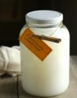
homemade LAUNDRY DETERGENT

Please continue to drop off any of the laundry soap materials in the office as soon as possible. Once we get enough materials we will plan a day for the youth to make the soap.